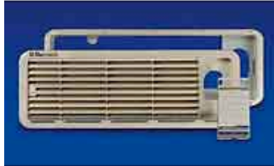
UPPER PART (winter cover not shown)